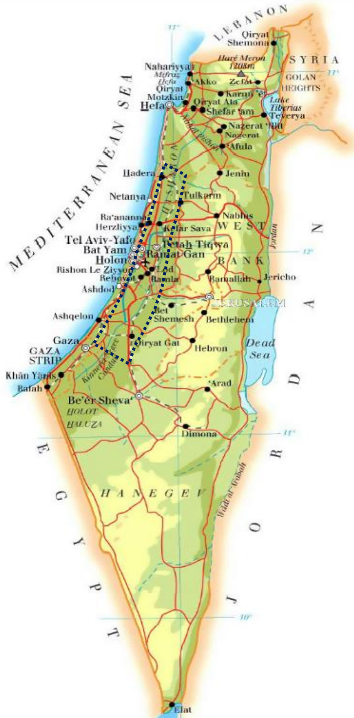
Figure 1: Map of Israel